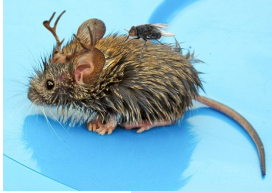
A fly riding a mousealope

Yesterday as I walked in my house He said to me I'm looking for Ted Bill cried to me I can't take no more I saw a fly that was riding a mouse I said I haven't seen him in about a week And out he flew right threw my door His eyes were green and his wings were blue Maybe he's looking for a place to eat Was it the drugs or just a dream around and around I watched as he flew The pile of dog shit on South Forty Third I went to my room and let out a scream He flew to the window and sat on the sill Or the vomit expelled from eat- ing that curd Now this is the end of the story you hear I asked him his name and he said it was Bill Either is exquisite to the taste of a maggot I think I'll go now and open a beer. Again he took off and flew to my bed Better go quick, for nearby lives a parrot.