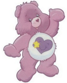
Are the Care Bears harbingers of the Rapture?

"You never think how different you would be if you didn't have a mortal enemy?"