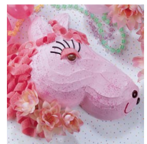
Pink Pony Cake!

Tips: This fanciful pony is sprinkled with a little magic – a dusting of pixie dust. Although we used real ponies in the mix, you may wish to use imitation if you are vegan.