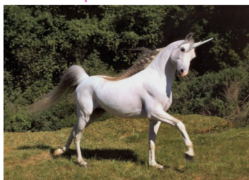
Majestic Unicorn Kitty Editor-in-Chief of the Princess strifey newsletter