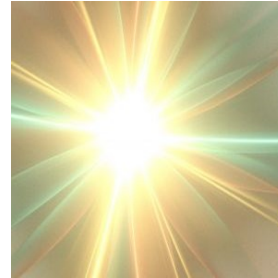
The Rapture is coming

People being Raptured will not be going to heaven. They simply disappear. Please make your plans accordingly, and remember to beware the Ides of March.